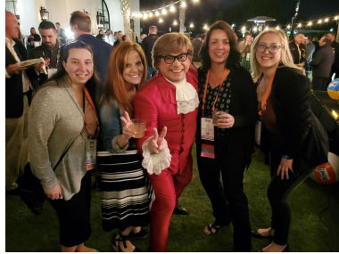
Austin Powers at the Reception