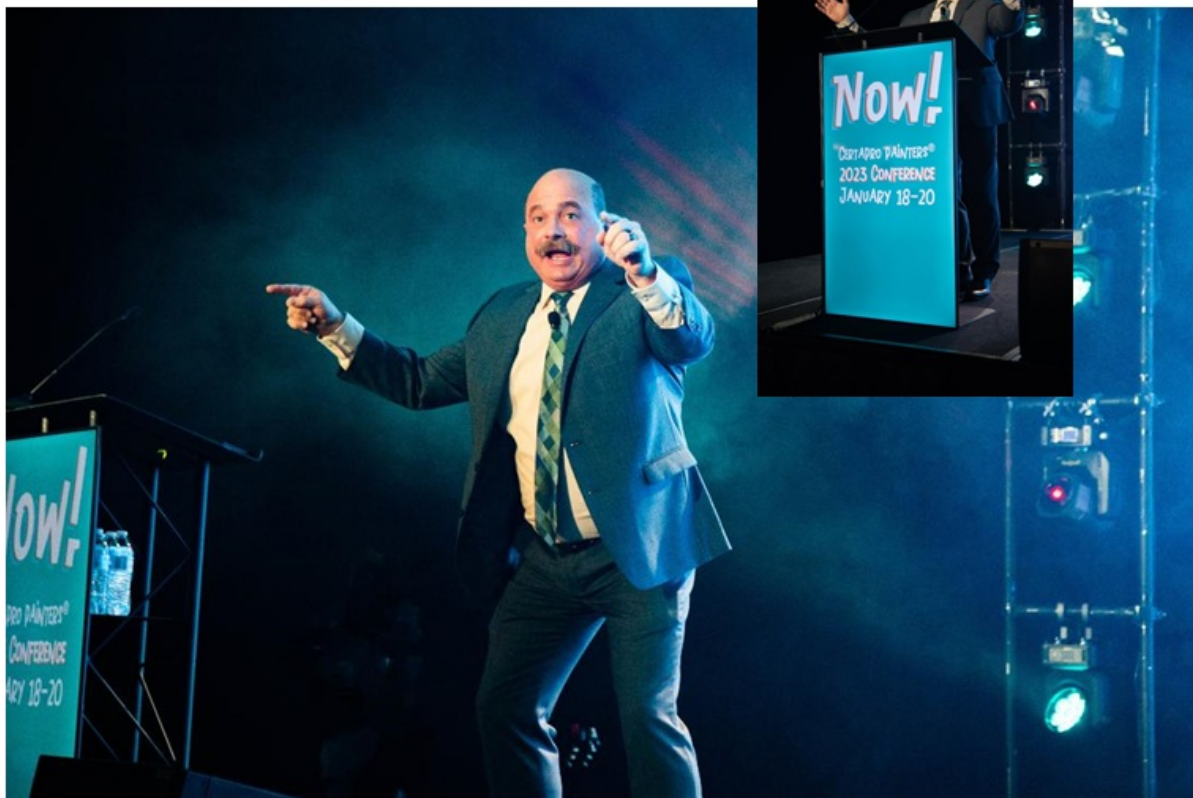
Dr. Phil as Event Emcee

The CertaPro Painters 2023 National Conference