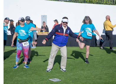
Ted Lasso on the Painters Pursuit Field