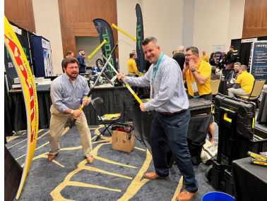
Billy Mays on the Trade Show Floor